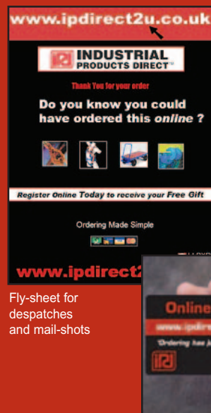
Fly-sheet for despatches and mail-shots